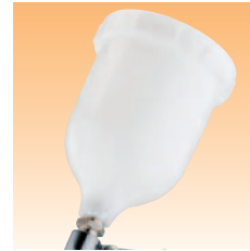
Gravity cup pt. no. GFC-501