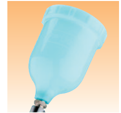
Gravity cup (Blue polyester) pt. no. GFC-511 for difficult fluids.