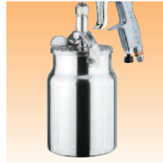
Suction cup pt. no. KR-566-1-B

Advance HD 's unrivalled spray performance is achieved with the utilisation of the very latest "cutting edge" atomisation technology. Advance has a wide range of high-grade Stainless Steel Fluid Tips and Needles, matched with Conventional Air Caps, manufactured from Plated Hard Brass for a long and durable working life. Select your Advance spray gun preference and nozzle combination's from the charts below to provide the Optimum performance for your individual spray process.