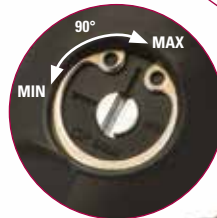
Low profile compensation valve